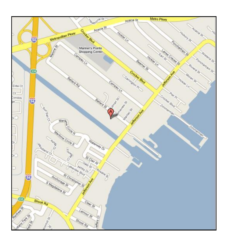
The L'Anse Creuse Amateur Radio Club meets at 7:00 pm the first Wednesday of each month, except during July and August. Meetings are held at Tucker Senior Center located at 26980 Ballard St. Harrison Township, MI 48045 unless indicated otherwise in the most current issue of the Tuned Circuit. Call-in on the Echo Repeater (N8LC) on 147.08 MHz (+ 600 KHz, 100 Hz PL tone) for any meeting information, or to ask a member for the location of the meeting.